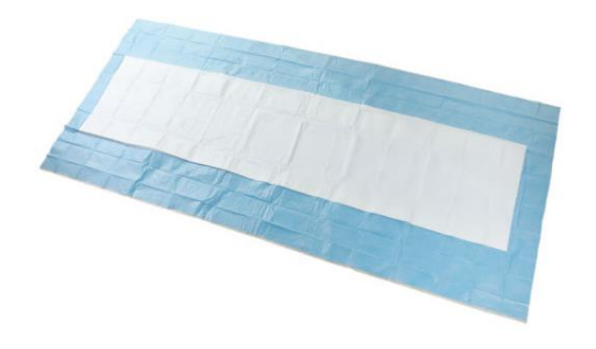
Figure 7: Disposable surgical table sheet type 1

sheet is used for surgeries that are characterized by a long duration and are often linked to a high loss of fluids.