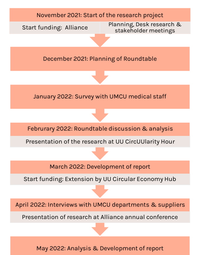
Figure 1: Outline of the research project's main steps per month

First, to gain an overview of the state of the art of the literature addressing disposable medical products used in the OR, scientific literature, webinars and blog articles were scanned and prioritized. Additionally, the stakeholders involved in the topic of circularity in the healthcare sector throughout the Netherlands were mapped to understand the involvement of different parties in this topic and their focal points. Meetings with different stakeholders such as a member of the Green OR,