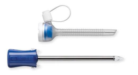
Figure 4: Disposable trocar

In terms of circularity, trocars are an important product to analyze since all laparoscopic or other minimally invasive surgeries require this instrument, and around 3-4 trocars are used per procedure. Therefore, the introduction of an alternative, more circular usage of this product is advised.