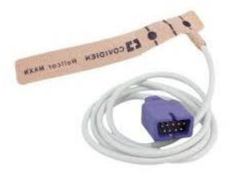
Figure 6: Disposable finger pulse oximeter

The finger pulse oximeter is the fourth selected disposable product and is used in the OR to measure the oxygen saturation of the patient during the surgery. For every surgery, at least one finger pulse oximeter is used, and as pointed out during the roundtable discussion, often also two are used in case the first one does not work properly right away. The disposable version comprises a small 'bandage' including the sensor that is being attached to the patient's finger as well as a cable that allows the product to be connected to the monitoring machine (see Figure 6).